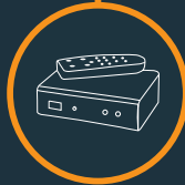
Set top box